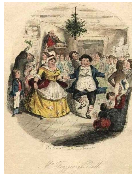
~John Leech's Mr. Fezziwig's Ball , from Dickens' A Christmas Carol

"Kirkwood Presbyterian Church is a joyful community of faith— seeking, serving, and sharing Jesus Christ."