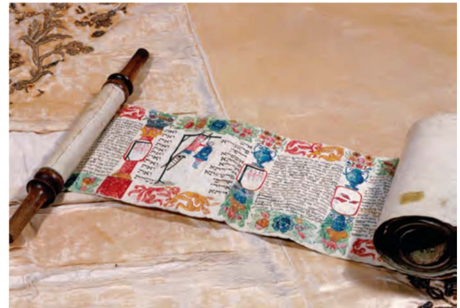
Scroll of Esther. Italian, 18th c. Hechal Shalom Wolfson Museum, Jerusalem.

“Kirkwood Presbyterian Church is a joyful community of faith— seeking, serving, and sharing Jesus Christ.”